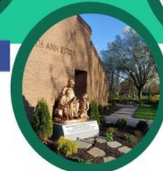
St. Elizabeth Ann Seton